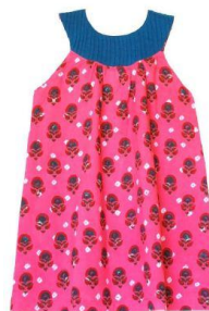
Girls Dress $72