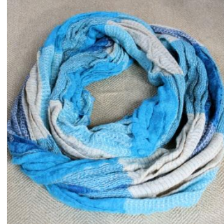
Infinity Patchwork Scarf $44