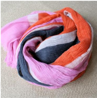
Colorblock Pleated Scarf - Pink $46