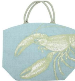
Lobster Jute Beach Tote $20