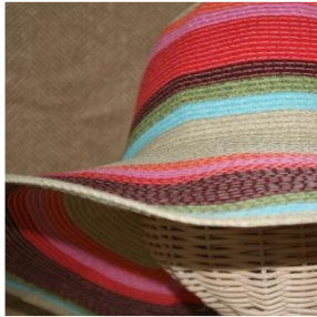
Multistripe Sun Hat $40