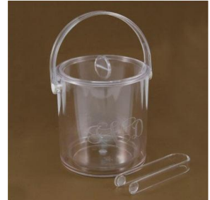
Monogram Ice Bucket $42