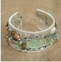
Cuff Bracelet $60