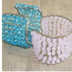
Cuff Bracelet $54