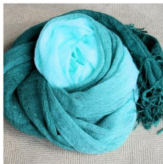
Dip Dyed Scarf - Mint Green $40