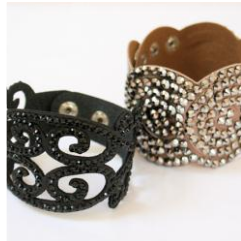
Rhinestone Cuffs $20