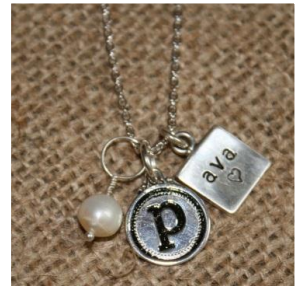
Stamped Charm Necklace ($63 as shown)