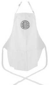
Monogram Apron $30