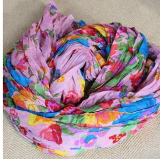
Floral Crinkle Scarf $42