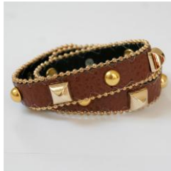
Studded Wrap $30