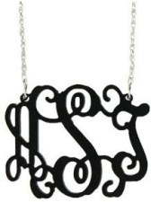
Acrylic Monogram Necklace $70