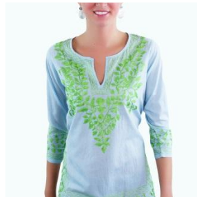
Blue Embroidered Tunic $110