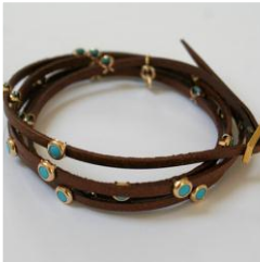
Wrap Bracelet $30