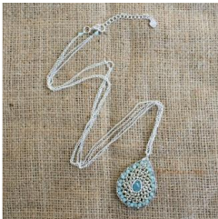
Aqua Beaded Pendant $60