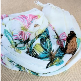
Butterfly Scarf $42