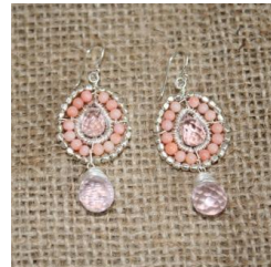
Pink Beaded Earrings $35