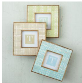
Pastel Ikat Frame $34