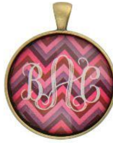
Behind the Glass Necklace $37