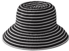
Packable Ribbon Sun Hat $26