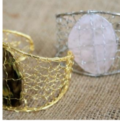
Cuff Bracelet $35