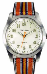
Barber Watch in Orange (Unisex) $75