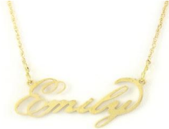
Filligree Name Necklace $92