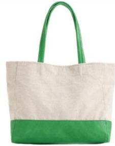
Valencia Tote Bag Green $60