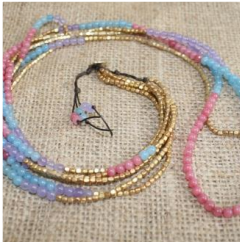
Triple Strand Necklace $65