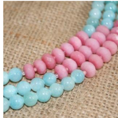
Azure Pink Necklace $96