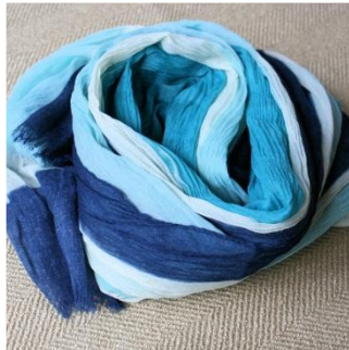
Colorblock Pleated Scarf - Blue $46