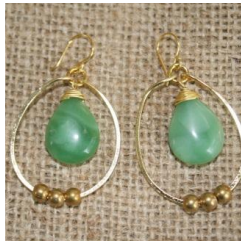
Green Drop Earrings $30