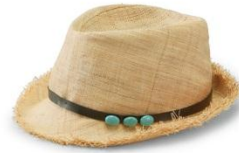
Raffia Fedora $42