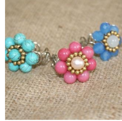
Rings $16 each