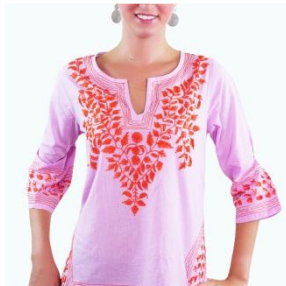
Pink Embroidered Tunic $110