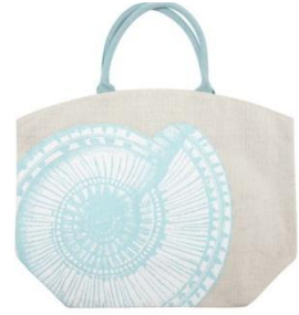
Shell Jute Beach Tote $20