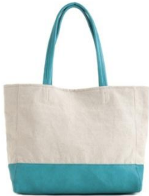
Valencia Tote Blue $60