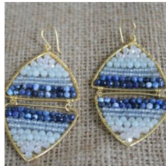
Blue Beaded Statement Earrings $49