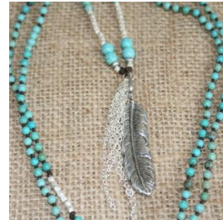
Turquoise Feather Pendant $60