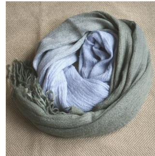
Dip Dyed Scarf - Lavendar $40