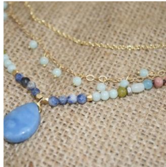
Mult Color Necklace $50